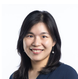
Esther Goh Centre for Evidence and Implementation